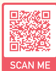
EXHIBIT HALL SCHEDULE

Click here to make payment via credit card on our website or scan the QR code.